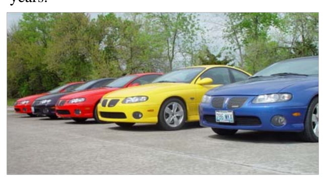
Wow, five GTO's

The first road trip in the GTO was a small weekend run to Kansas City. A few members from LS1GTO.com and I decided to meet up in early 2004. At that point there were very few of these cars in the country. I had one of first ones in the whole St. Louis area. So when we all met in KC, we were all ecstatic to have five cars show up. That was the first time When I picked up the car, the salesman we'd see that many of the new GTOs in one place. There were three cars from Missouri, one from Kansas and one from Iowa. It was a that I would end up talking to and actually hanging out with several times throughout the years.