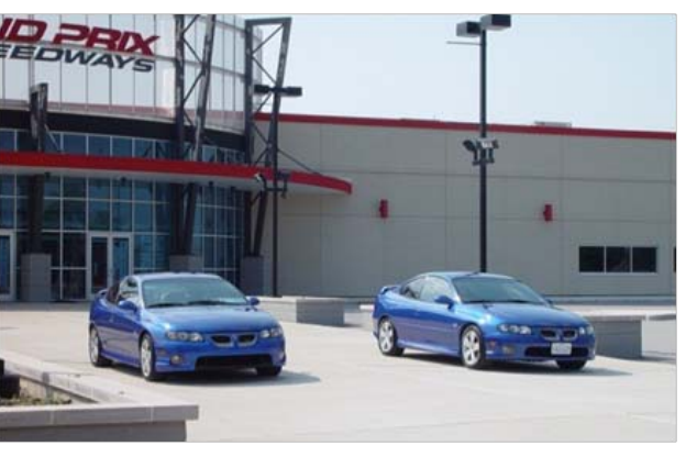
The Blues Mobiles

party and the Stars & Cars gala dressed as Jake and Elwood. We were even coaxed into an improvised dance routine, which actually didn't turn out too bad (I'm sure the alcohol helped).