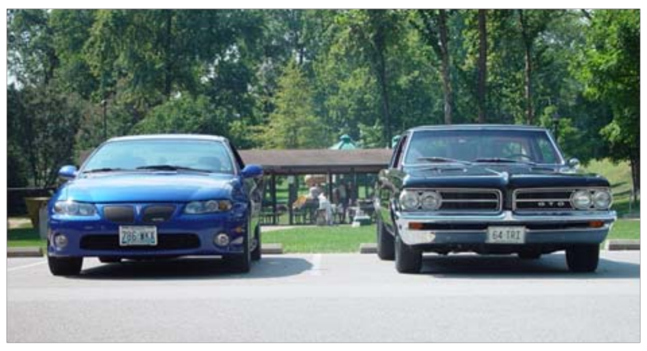
The new kid and the original muscle car

Now it is ten years later and the GTO is still my daily driver. It's starting to show its age and needs a little work, but whenever I fire it up I still get that roller coaster feeling. Some times are stronger than others, but it's still almost always there. I can only hope that every GTO owner has had as much fun with their Goat as I've had with mine. I've officially had one full decade's worth of good times with the GTO. Hopefully there will be many more to follow.