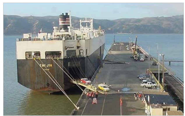
GTO's fresh off the boat from Australia

start climbing that first hill on a rollercoaster. I at automotive events, I've learned so much and was hooked.