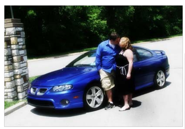
Engagement picture: You might see the GTO hiding in the background somewhere

gagement photos. I've been working on turning her into a regular car nut. She even had a *gasp* Mustang for a while and she enjoyed it until the first really harsh snow storm, where rear wheel drive became a problem. Since then she's moved on other vehicles, but think I've at least got her hooked on power. Now she's not happy unless she can mash the go peddle and have it respond accordingly.